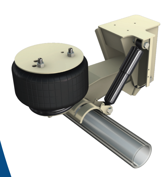
RAR-240 Overslung 25,000 & 30,000 lb. capacities 11½" - 24" ride heights

For all applications, including severe service