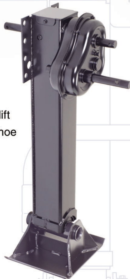
LG-5500 Series 4.5" Standard Sandshoe (shown)