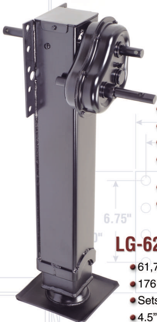
LG-6200 Series Self-leveling foot (shown)