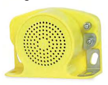
696087, 696097 & 696107