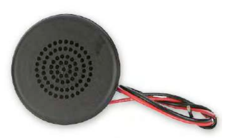
697187 & 697197