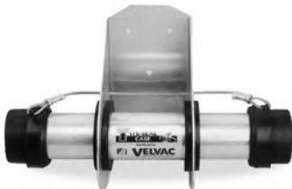
Case with bracket and CapKeeper™ cable