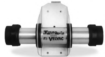
Standard case with bracket