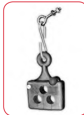
Hose and cable suspender US Patent No. 4,358,082

NO SNUBBER CHAIN for use only when pogo stick is at least 24" away from cab