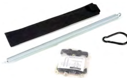
Replacement tracker bar kit